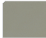
124 Pearl Grey