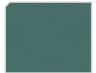
895 Vista Green