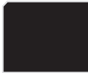
501 Black Sandtex